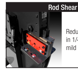
Reduce deformation in 1/4" to 1" mild steel rod

Connects to the Ironworker to provide task lighting