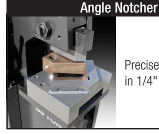
Precise 92° Notch in 1/4" mild steel