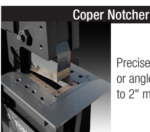
Precisely notch plate or angle up to 2" mild steel